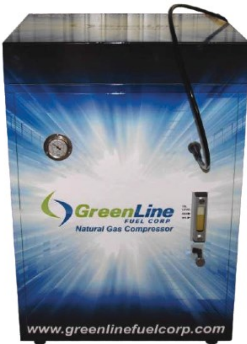
Shown with optional wrap

The GreenLine GL-10 Series is a fully integrated CNG fueling system that delivers industry leading features, reliability and safety. The GL-10 provides a 4.3 GGE/hr. CNG fill rate, making it the perfect fit for a one to three truck fleet looking to dispense up 45 GGE per day. Based on the reliable and time proven Coltri multi-stage compressor, the GL-10 features a low maintenance design and a 40,000 hour operational life.