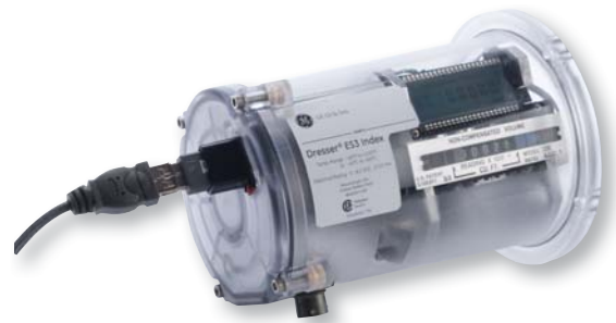
ES3 Communications Cable