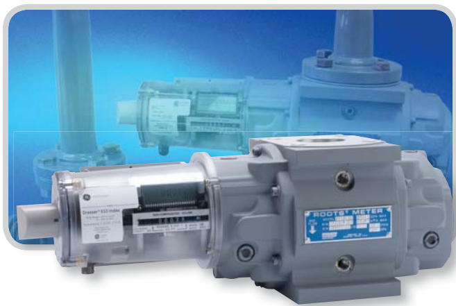
Series B3 meter with ES3 and AMR mounting bracket installed