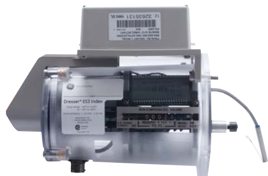
ES3 with AMR device installed