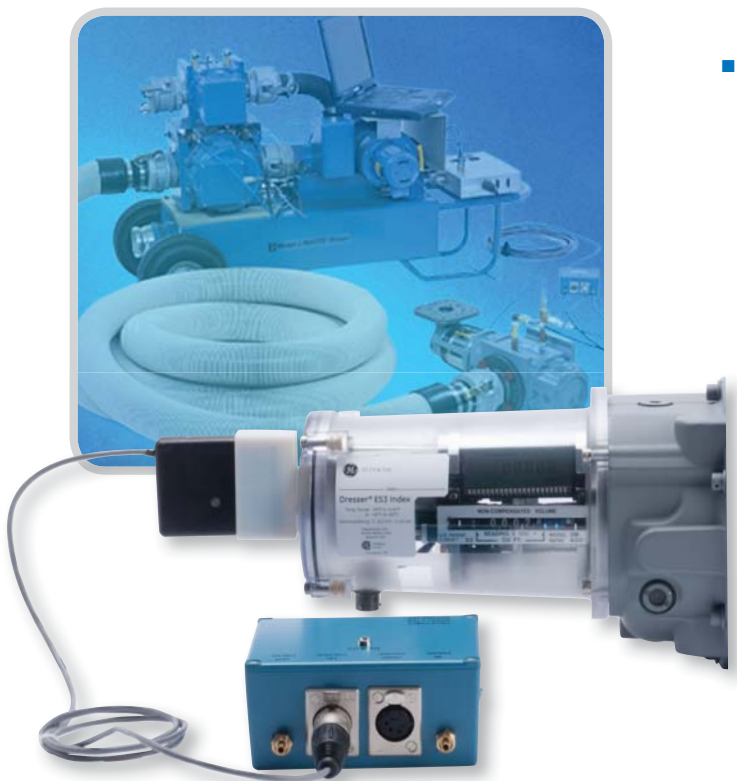
ES3 Prover Cable to Model 5 Prover Field Junction Box