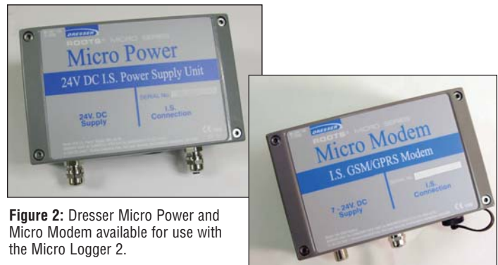
Figure 2: Dresser Micro Power and Micro Modem available for use with the Micro Logger 2.