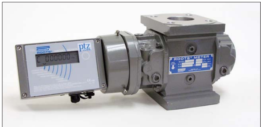
Other Available Micro Corrector Model - IMCW2