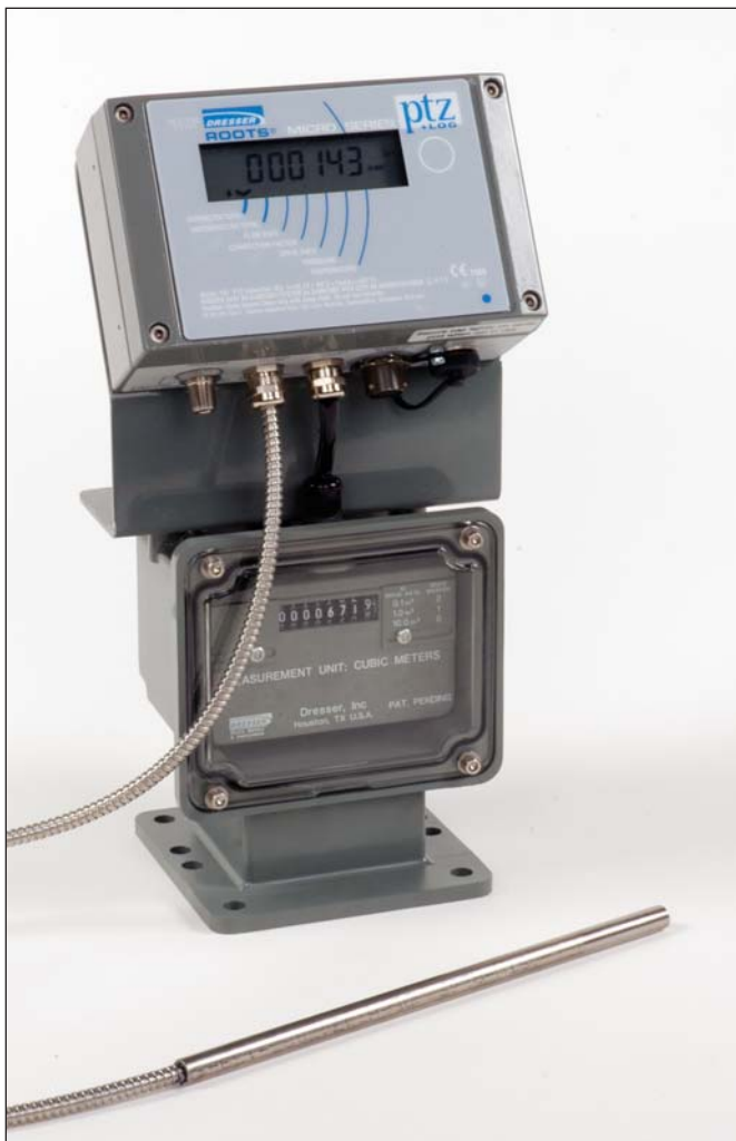
GE Micro Corrector, Model PTZ + Log, ID Mount Version

This second generation Micro Corrector has the enhancements customers have been asking for. Using the proven MC platform, features were added that make it the easiest corrector to use. Functions were added that enhance data logging and lower operation and maintenance costs, while retaining the great features introduced in the original product.