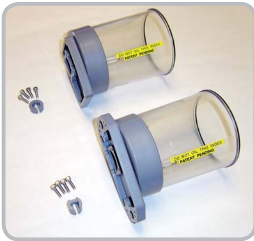
AMR Adapters for GE Series B3 meter