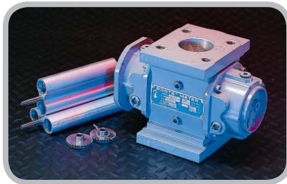
GE Series B meter bodies accept a wide range of Series 3 accessories for all metering applications

-40°F to +140°F (-40°C to +60°C) while the temperature compensating mechanism of the mechanical TC accessory provides a corrected reading for temperatures ranging from -20°F to +120°F (-29°C to +49°C).