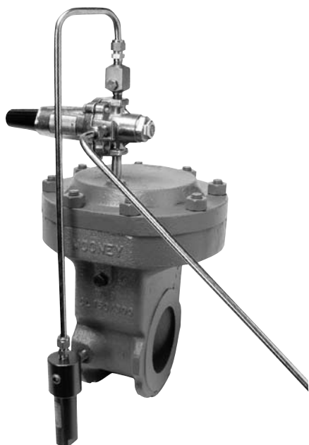
4" Single Port Type A Flangeless Flowgrid® Valve with Series 20 Pilot