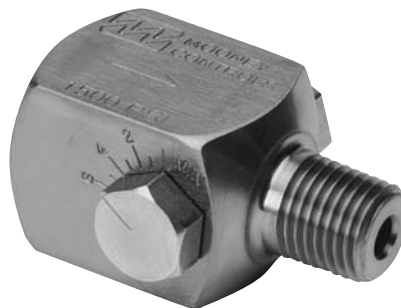
Figure 1. Type 24 Mooney® Restrictor

The TYPE 24/24S MOONEY® Restrictor is an integral part of a pilot system for the FLOWGRID® Regulator. It is usually located in the pilot supply and affects the response rate, stability, and sensitivity of the regulator. The restrictor is available in both steel and stainless steel constructions with a stainless steel rotor. The TYPE 24/24S Restrictor can be used in many other liquid and gas applications.