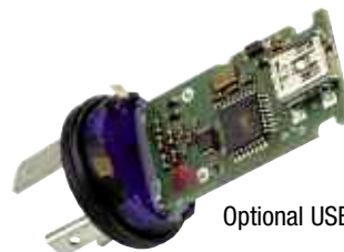
Optional USB programmable output

Also available with our 1800 Series Attachable Loop Indicator. See page 44 for more information.