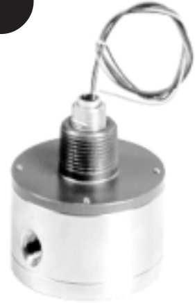
TM02DSHE Representative Model

With only two moving parts and exceptional pressure loss characteristics, Mini Oval is the intelligent approach to metering systems. With flow rates in 0.03-20 GPM range, FPP Meters versatile Mini Oval Series offers either non-factored pulse output or electronic registration.