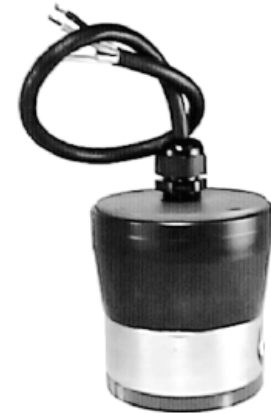
TM04AT0A Representative Model

With only two moving parts and exceptional pressure loss characteristics, Mini Oval is the intelligent approach to metering systems. With flow rates in 0.03-20 GPM range, FPP Meters versatile Mini Oval Series offers either non-factored pulse output or electronic registration.